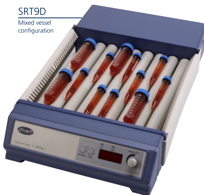
SRT9D Mixed vessel configuration