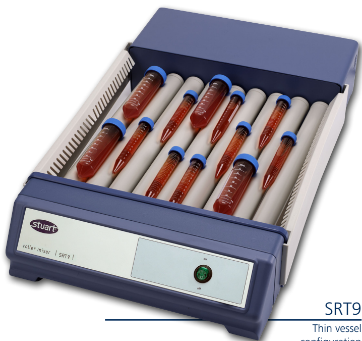
SRT9 Thin vessel configuration

The SRT stacking system consists of four magnetic stacking blocks that are designed to allow rollers to be stacked on top of one another, thus saving valuable bench space. Up to three rollers can be stacked in virtually any combination. Fitted in seconds, without any need for tools, the stacking blocks are easy to move into the optimum position where they hold the rollers securely in place by powerful magnets. They are equally as easy to dismantle if required for storage or cleaning purposes.