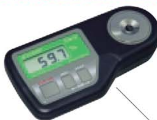
PR-201 \alpha Cat.No.3452