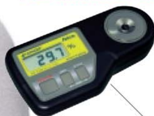
PR-32 \alpha Cat.No.3405

Four models of the Palette \alpha are available for your different measurement samples.