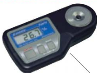
PR-101 \alpha Cat.No.3442