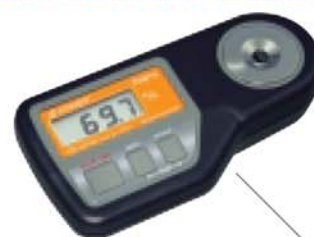
PR-301 \alpha Cat.No.3462