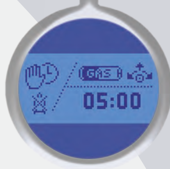
Gas consumption display