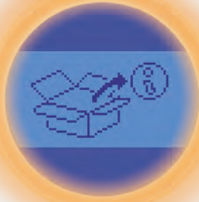
Graphical installation instructions