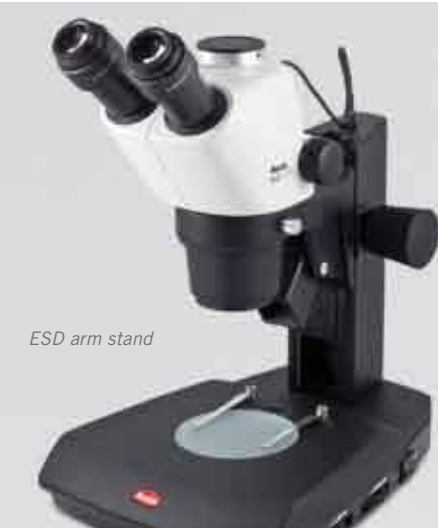
ESD arm stand

With its standard configuration, the SMZ-171 provides a large working distance of 110 mm , which can be easily extended to 301mm (with additional auxiliary objective 0.3X). To achieve a desired total magnification, objective magnifications less than 1X may be compensated by using high magnification eyepieces (up to 20X).