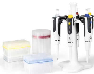
Pipette Package 2