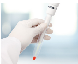
Narrow centrifuge tubes