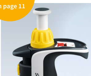
Easy Calibration technology