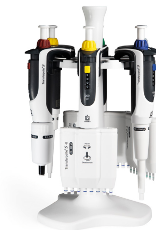
Bench top rack for 6 Transferpette® S single- or multi-channel pipettes.