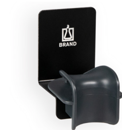
Wall mount for 1 Transferpette® S single- or multi-channel pipette.