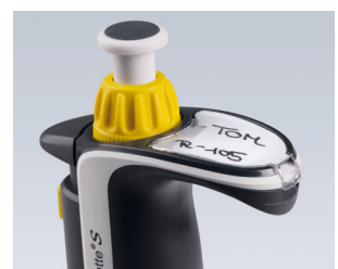
Label on the finger rest