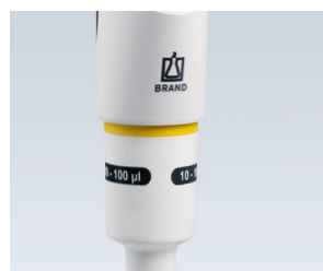
Integrated shaft coupling