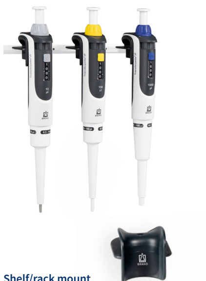
Shelf/rack mount for 1 Transferpette® S single- or multi-channel pipette.

With holders and stands, the devices are always properly stored and close at hand for the next application.