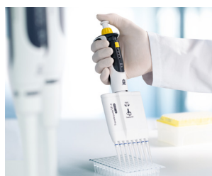
Working with PCR plates