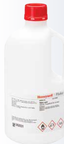
Honeywell Fluka - Nitric Acid TraceSELECT 84385-2.5L

The reduction of metals into mercury is more favourable than reduction to the solid-state electrode. Further on there is always a clean new Hg electrode surface available for each measurement.