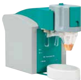
Multi-mode Electrode (MME)