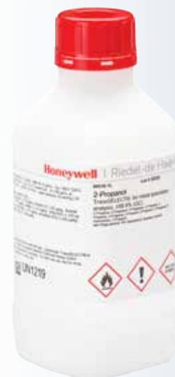
Honeywell Riedel de Haën - 2-Propanol TraceSELECT 04516-1L

Performing a speciation analysis in a complex mixture involves separation, identification, and characterization of various forms of elements in the sample. The most commonly used strategy for speciation analysis is to perform a separation step before a generic detector.